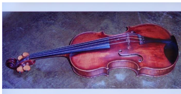
The Cardinal's viola which he used while at Oxford playing 'tenor' in string quartets.

More details about this event, the venue, the speaker and the musicians are available on the enclosed invitation. We hope you will be able to join us!