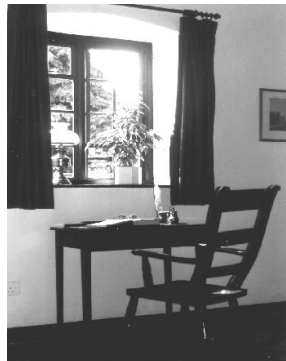
Newman's private room

Every Wednesday there is a Holy Hour in Newman's chapel at 7.45 pm open to everyone.